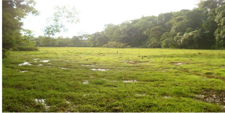
Pathaha (swimming pool or bathing pond)

The king's bath is the largest of the kind to be used by a king. The dam that brought fed the pond is still to be found near the Aswana temple though not in working condition due to blockages in underground waterways.