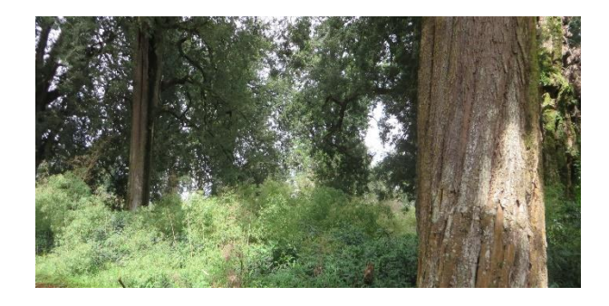
Figure 4: The growing bamboo of the Mt. Elgon National park in the Podocarpus dominated zone

voucher records and help in the assessment of potential shifts in Cruciferae habitats and evaluate the associated natural and anthropogenic causes of habitat changes. GPS recordings and analysis of plant communities for these related Cruciferae genera are crucial in order to improve understanding of the associated floristic composition in the wild and the community contribution in their growth and establishment. This would also help in the evaluation of upward shift of species due to meteorological elements variation following an elevation gradient. Unlike the Cherangani Hills, Mt. Elgon still has considerable patches of bamboo zone as shown on Figure 4 below.