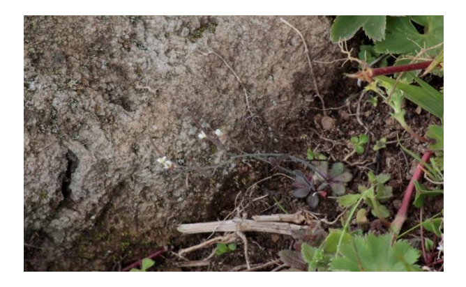
Figure 2: Arabidopsis thaliana growing on a roadside and partly rocky substratum and soil-leaf-litter vegetation in the Mt. Kenya (Chogoria route) expressing conspicuous white flowers and showing a rosette leaf pattern.wers.