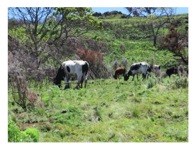
Figure 5: Controlled grazing at the grassland zone, a compromise conservation approach that involve the community in forest conservation

The habitats of Cardamine hirsuta has been declining and there is increased frequency in the identification of the hybrid Cardamine flexuosa . Most of the past collection sites indicated lack of living vouchers and this could be attributed to livestock grazing inside the protected national parks and reserves, particularly in the grasslands of Mt. Kenya and Mt. Elgon. Other anthropogenic disturbances that may affect the spatial and temporal distribution of the montane Cardamine include grassland fires, road construction inside the parks, large herbivore grazing patterns and behaviour (elephant, buffalo, antelopes), and the ever changing weather patterns. Road construction negatively impacts the roadside vegetation by introducing alien species to the forest ecosystem, particularly colonizing the roadside plant communities.