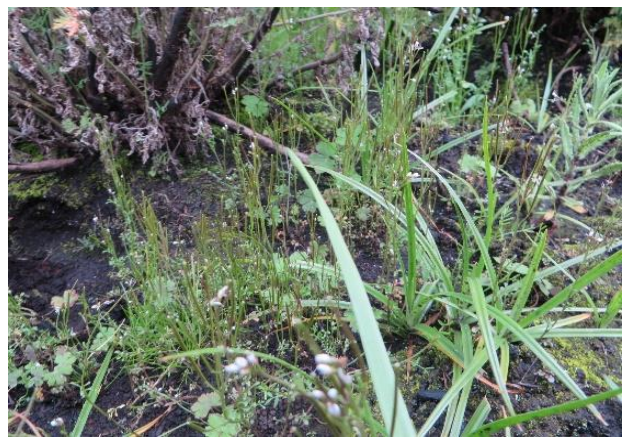
Figure 1 : Mature Cardamine hirsuta showing prominent white flowers and greenish apical siliques growing on a recovering burnt grassland from wild fire in the Mt. Elgon National Park and Reserve in Western Kenya.

Capsella, Thlaspi, Camelina, Lepidium and Coronopus (Agnew, 2013 ). The main focus of this study was to explore the geographic distribution, morphological and anatomical variations of mature and reproductive wild Cardamine hirsuta sampled in its natural habitat (Figure 1) and compare the information collated with that of the herbarium voucher specimens collected over the years. Some publications have documented clearly the similarities and differences among the two closely related genera particularly the Bitter Cress ( Cardamine hirsuta ) and its wild relative, Thale ( Arabidopsis thaliana ).