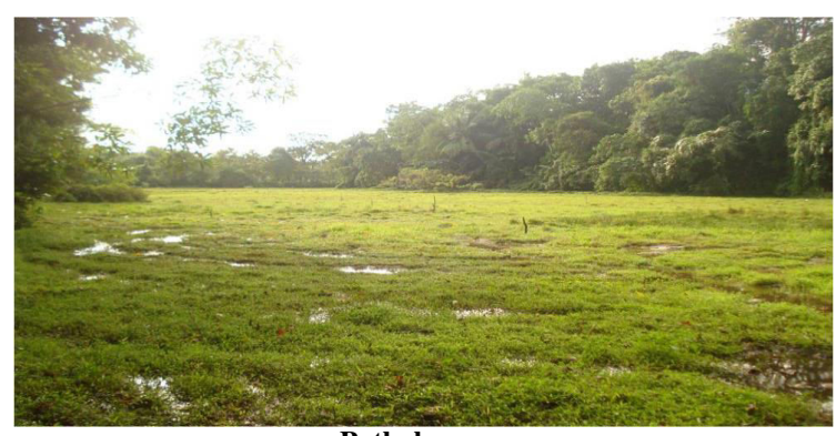
Pathaha (swimming pool or bathing pond)

Though further posthumous evidence of King Sakalakalawallabha are not to be found, the existing evidence indicate a well structured and successful reign. As historic texts attest, King Sakalakalawallabha was instrumental in safeguarding the Kingdom of Kotte. The remains of the protective moat and royal bath pond indicate the king safeguarded his own sub kingdom as well. The king's bath is the largest of the kind to be used by a king. The dam that brought fed the pond is still to be found near the Aswana temple though not in working condition due to blockages in underground waterways.